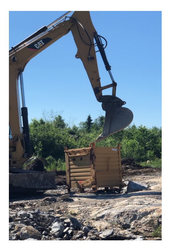
Grab sample of surface native gold